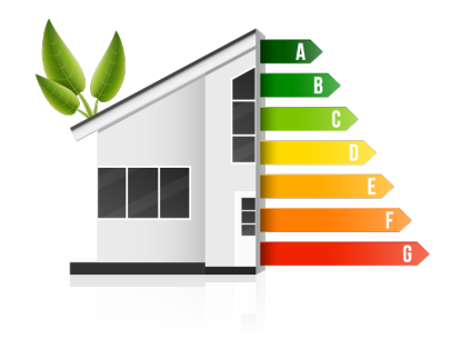
Energy certificate: Pending

This is a beautiful home that is well presented and requires an in-person viewing to truly appreciate this property.